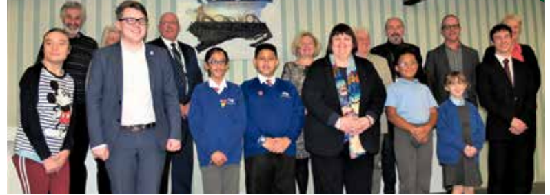
The Promise launch

of race, gender, religion, disability, LGBTQ+ status, language preference (Welsh)