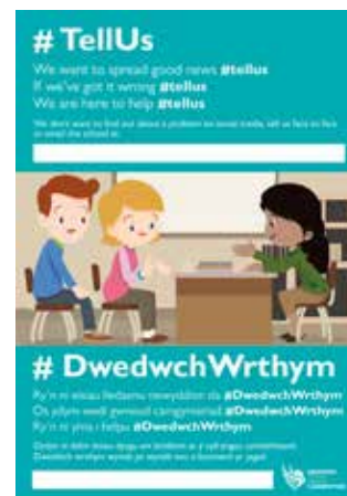
► The #TellUs campaign poster

Pupils are encouraged to tell their parents, carer or teacher if they are being bullied. There is advice on the council website visit www.newport.gov.uk/en/Schools-Education/Bullying.aspx